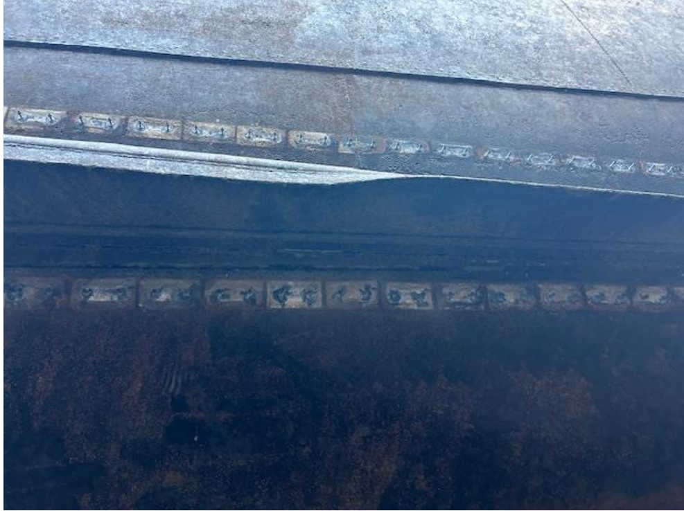
Top row Anode plates going back on (studs and nuts there), bottom row studs were removed and smoothed over.