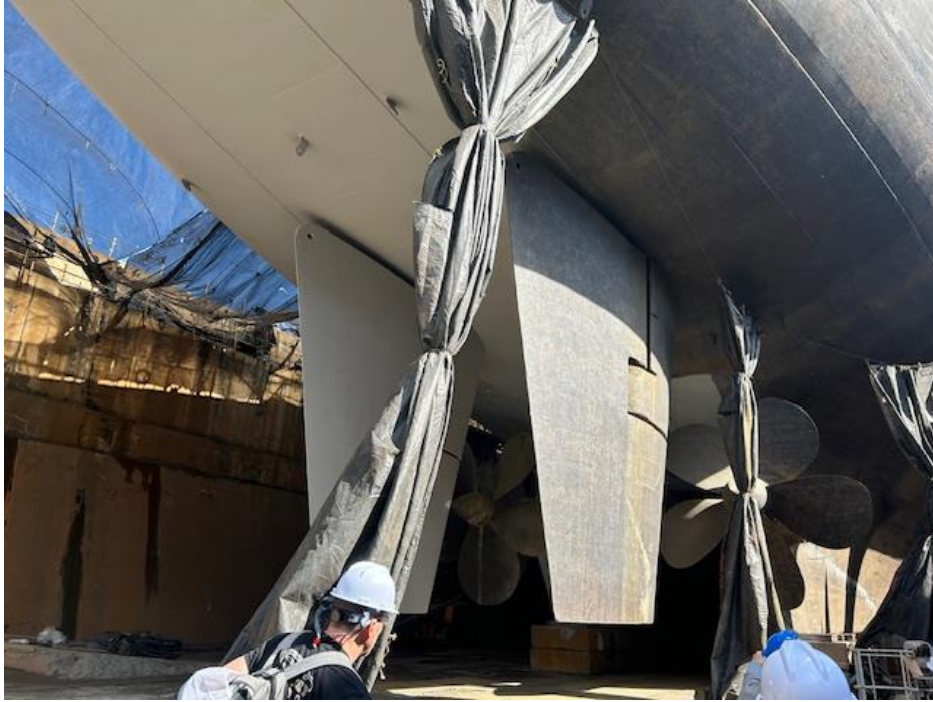
The one on the left was cleaned and primed, Right still raw. Final color will be red.