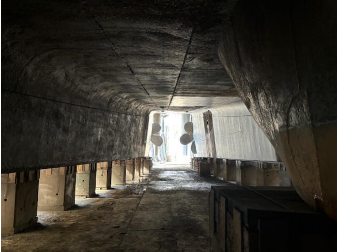
We went under the ship, here looking back.