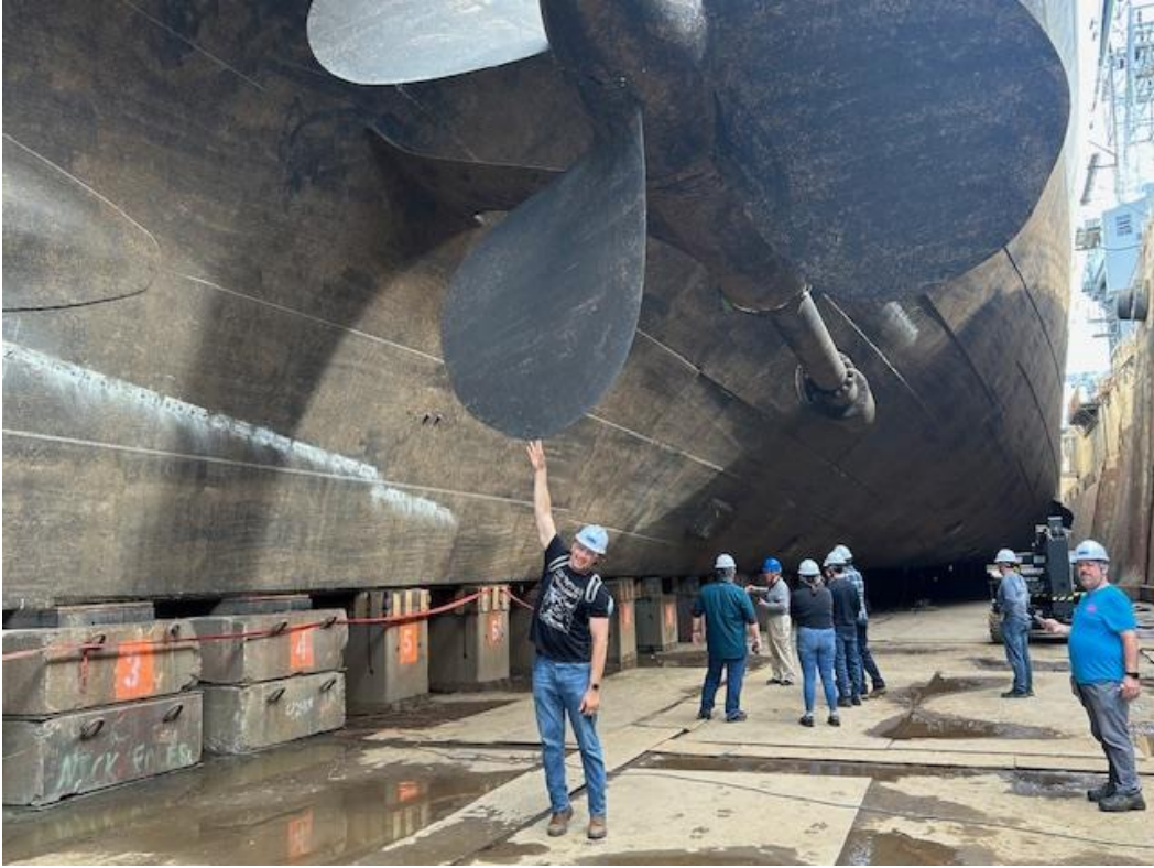
He was tall enough to touch, The props were BIG.