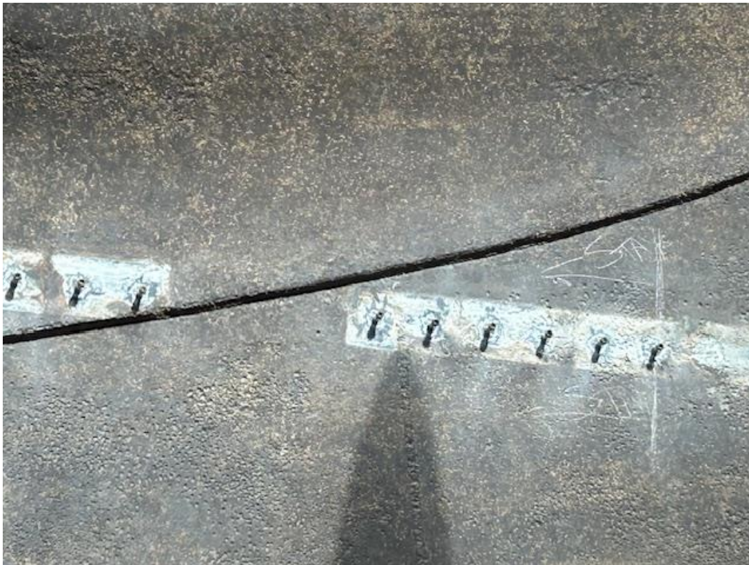
This is where the anode plates were bolted, Up and down both sides, They put the nuts back on the studs where they are going back.