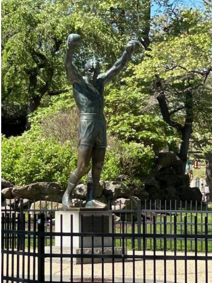
Statue next to the steps.

Took some pictures and it was time to go to the ship for our 4:00pm tour. Another Uber ride and we were at the ship, checked in, signed the waivers and watched the safety video.