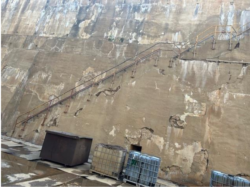
Went down these 120 steps into the bottom.