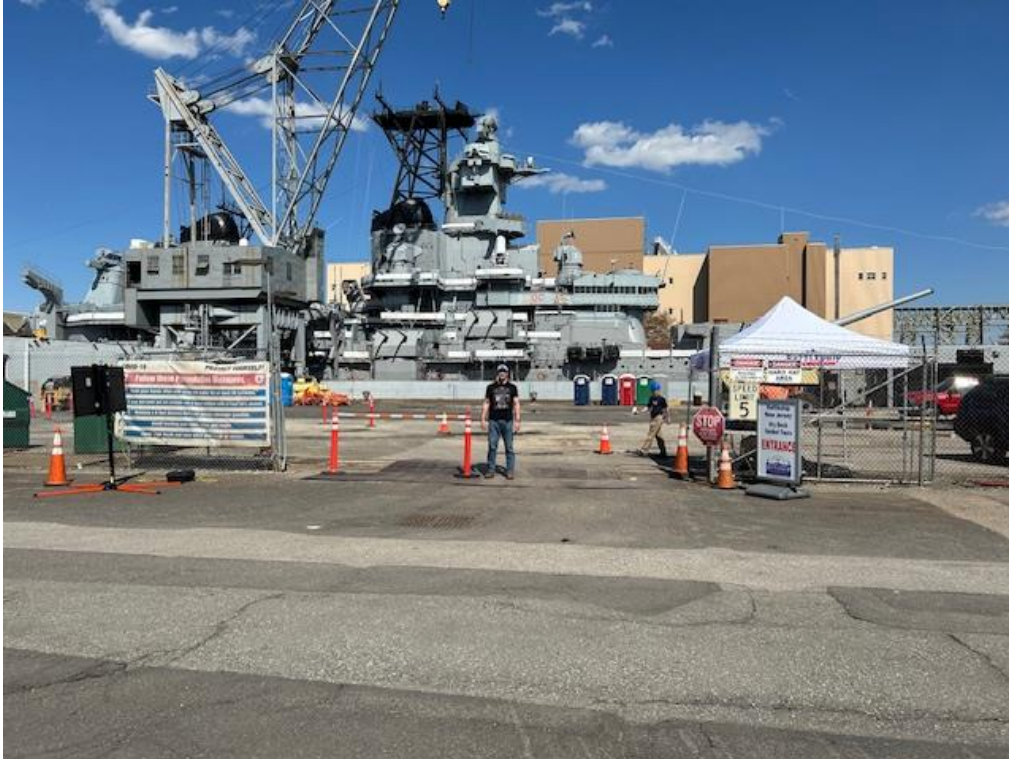
It is a BIG boat !