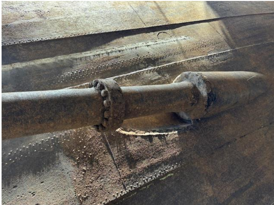
Big drive shaft too. They will repack the bearings to prevent leaks before done.