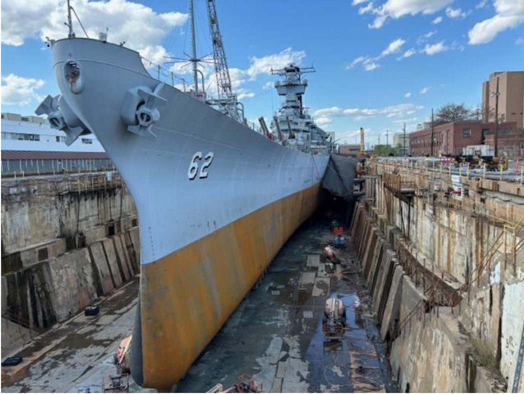
Light rust where they sandblasted the paint off.