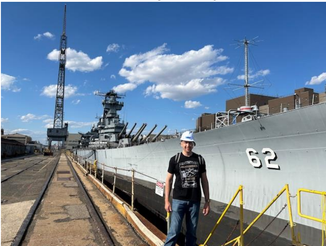
Back at the top.