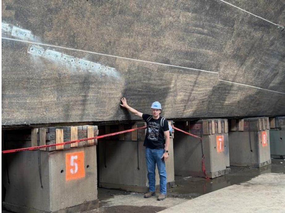
The outer hull was 1 ½ in thick with like a rubber coating.