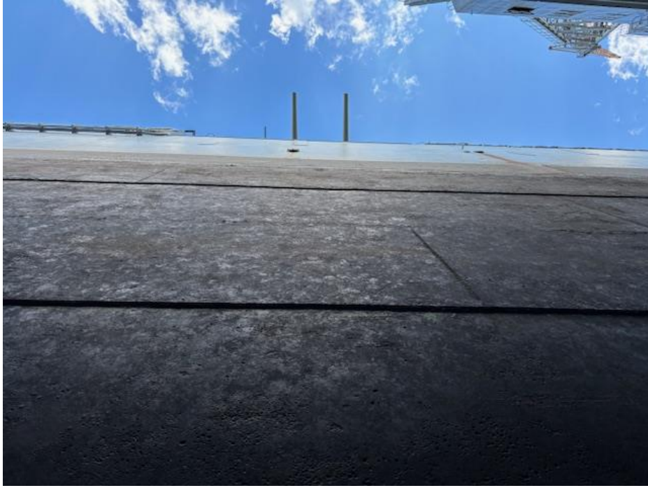
Looking UP at the 5 in gun mount.