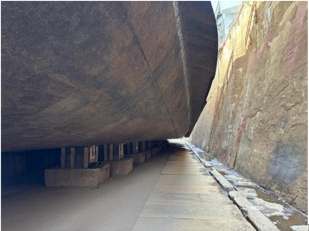
It was a tight fit into the drydock.