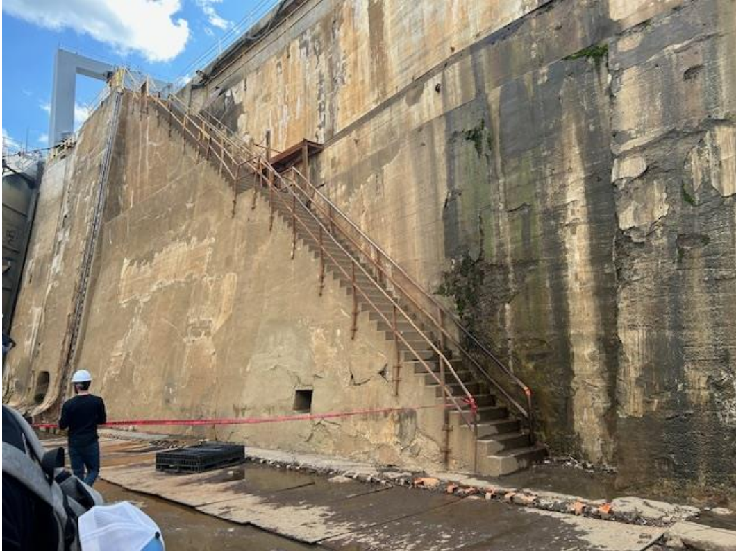
Here is the 120 steps we used to get out.