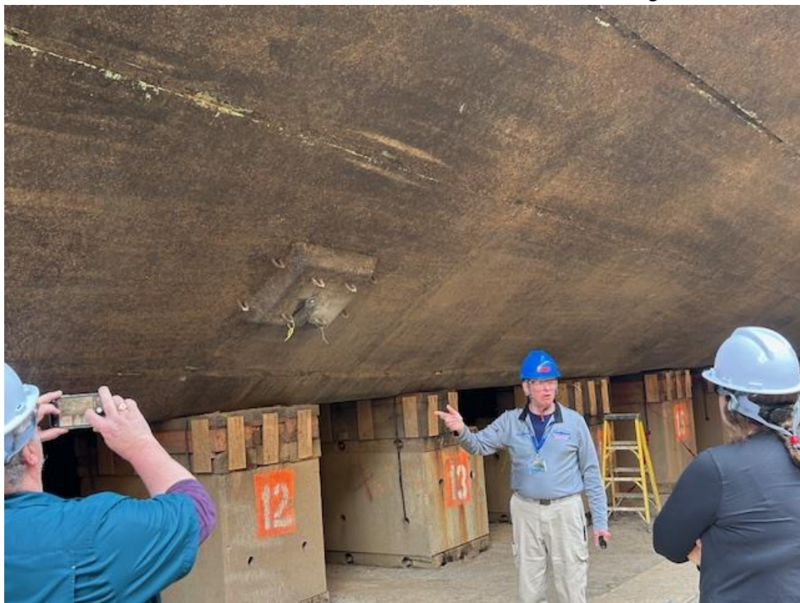
Our tour guide, this is a cover over a water inlet no longer used,