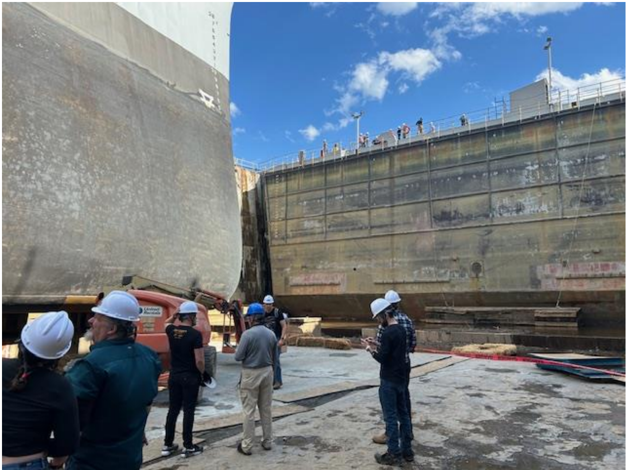
Near the bow, on the other side of that wall is 20 ft of river.