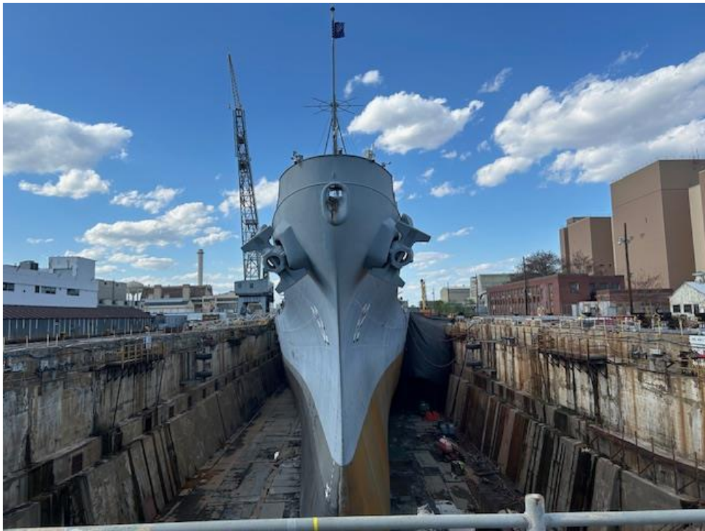
The Bow and the END.